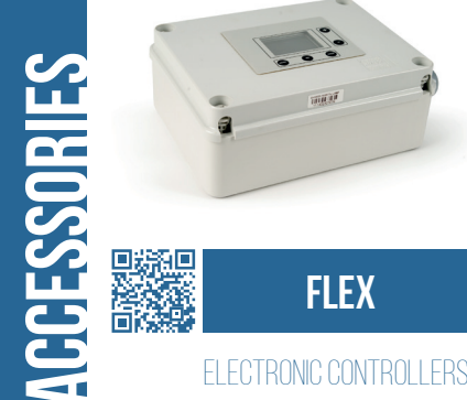
ELECTRONIC CONTROLLERS FOR HEATING MANAGEMENT SYSTEM