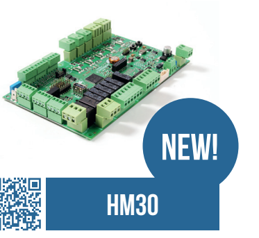
HYBRID HEATING & COOLING SYSTEMS